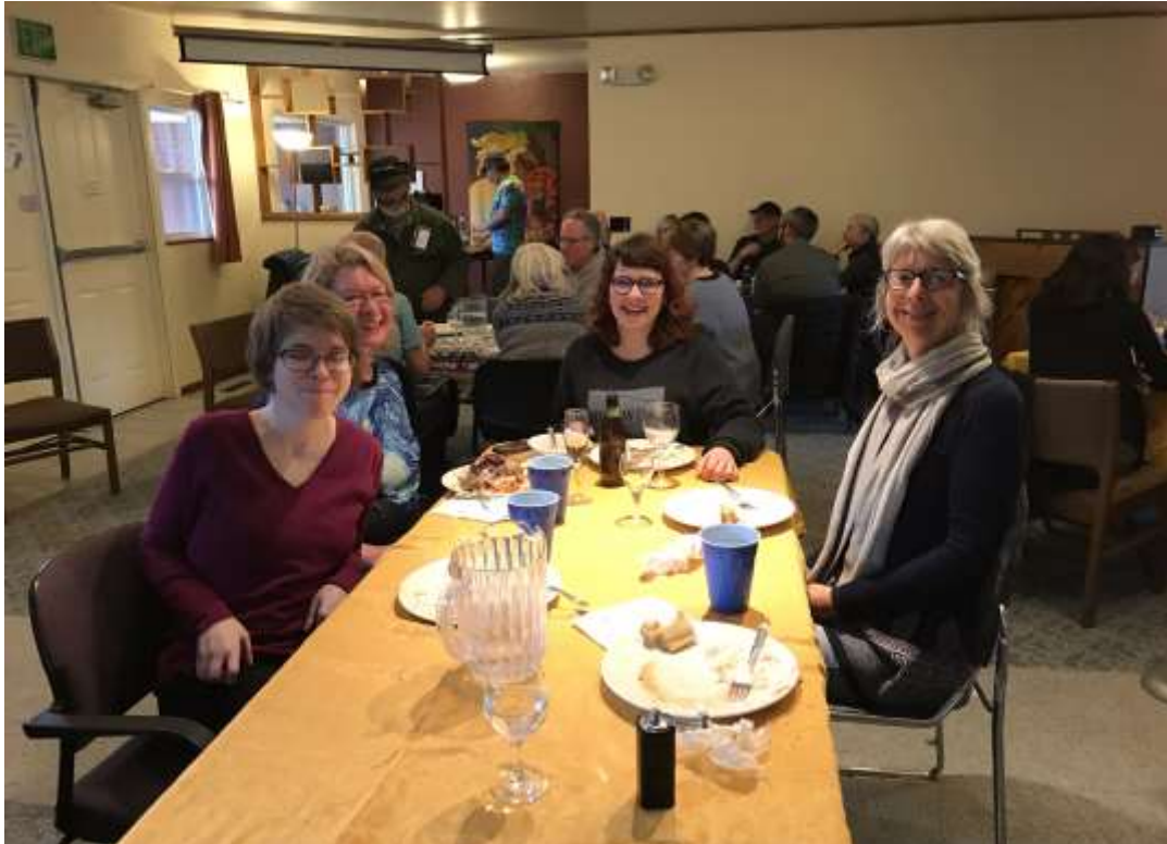
About 30 people gathered for food and fellowship for the CVUU Spring Potluck.