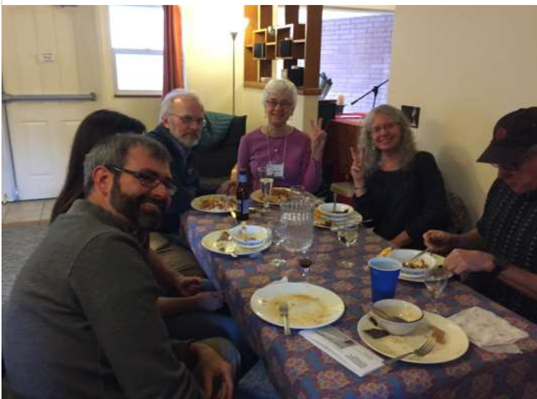
Polishing off a delicious meal