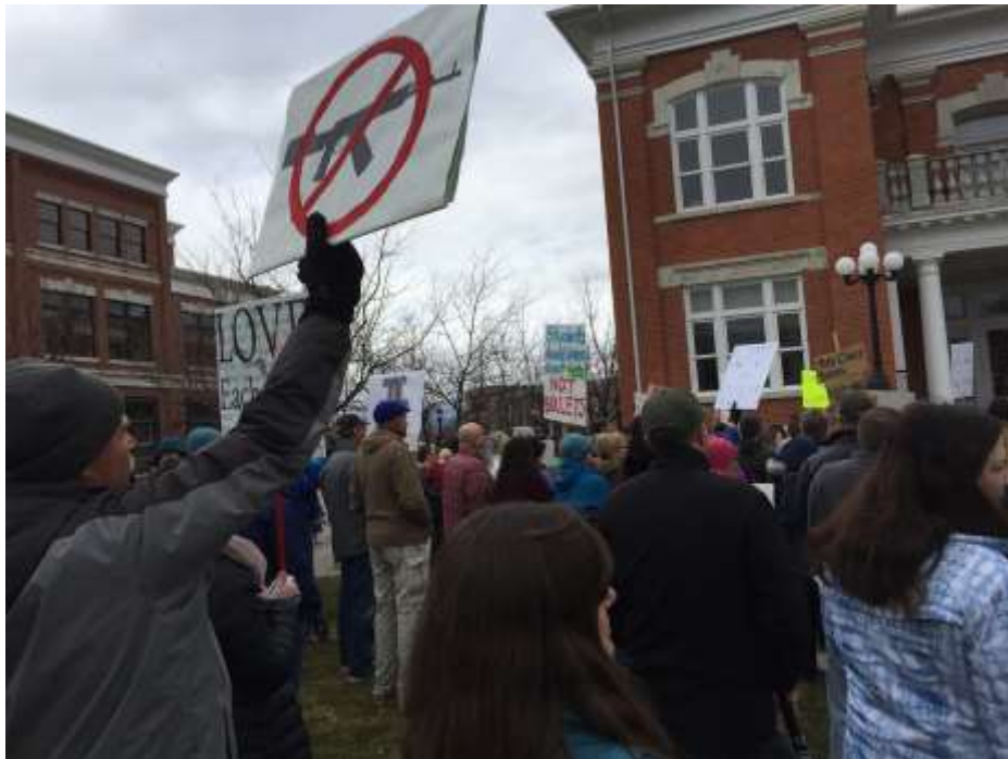
Many CVUUers attended the March for Our Lives rally against gun violence at the Cache County Courthouse on March 24 th.

5 TH SUNDAY POTLUCK: Join us following the Sunday service for a potluck. Bring a dish or other food item to share or come as you are!