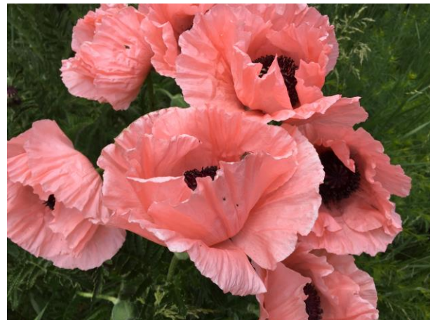
June Perennial poppies