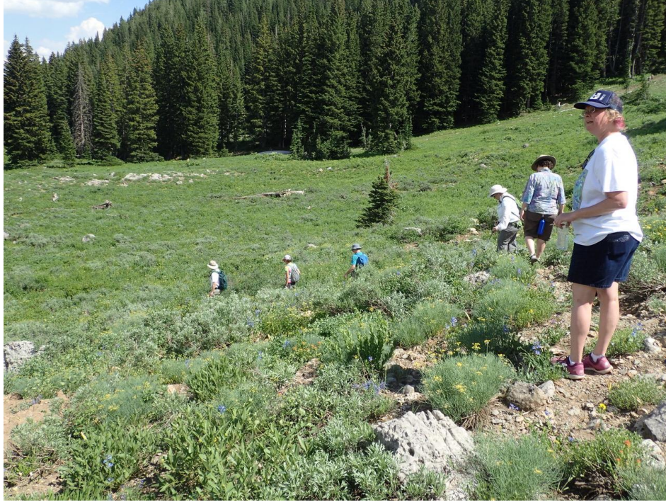
Beating the heat with a hike at Tony Grove Lake.