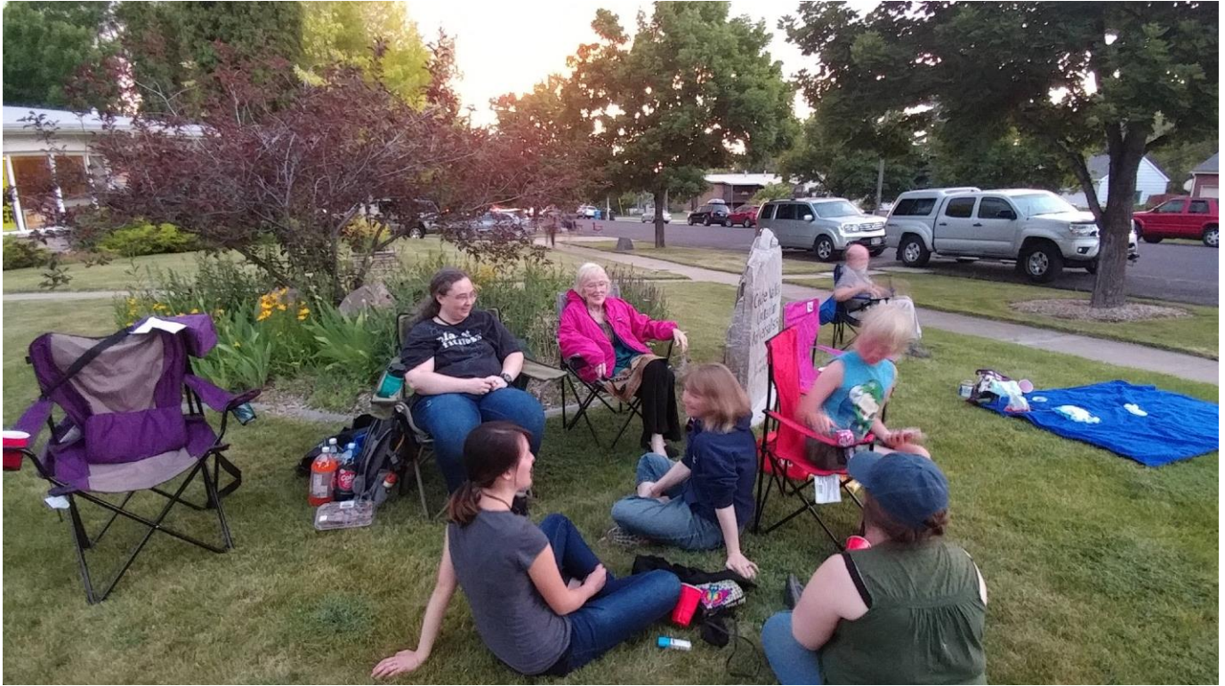
Gathering on the CVUU lawn to watch Independence Day fireworks: Photo credit: Susanne Janecke