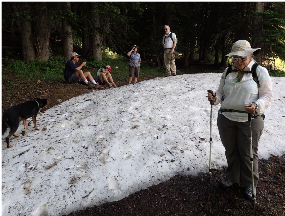
Contemplating snow in July.