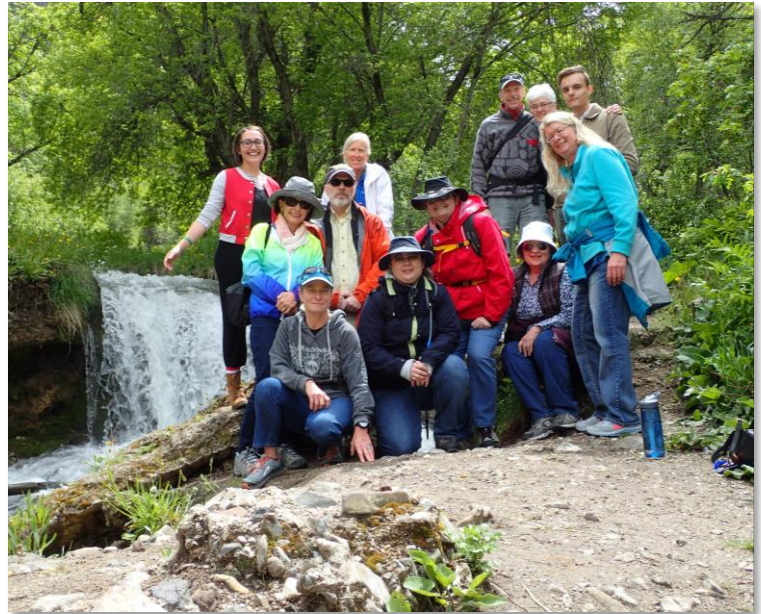
Waterfalls, wildflowers, and fellowship

Twelve CVUU hikers had a great time hiking and getting to know each other along the Logan River Nature Trail and enjoyed waterfalls at Spring Hollow on May 22 nd . All hiking ability levels welcome!