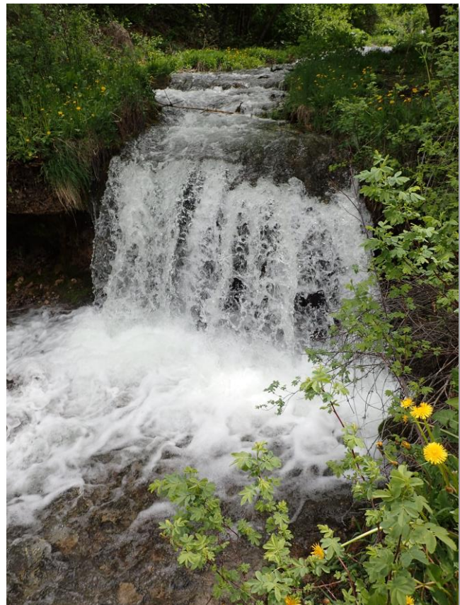
Hidden waterfall at Spring Hollow in Logan Canyon