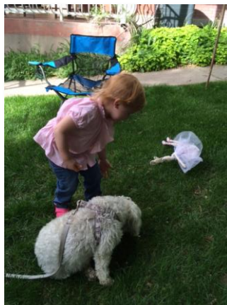
Fun with children and dogs