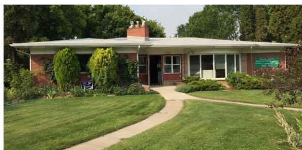
The Jay and Leslie Fellowship House