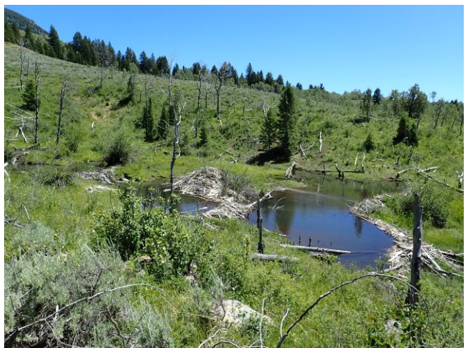
Beaver pond complete with dams and lodge (center)