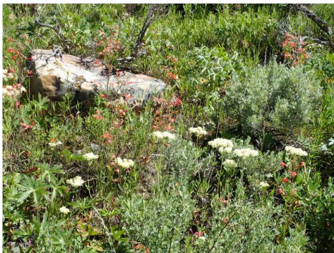
Wildflowers: Scarlet gilia and Buckwheat