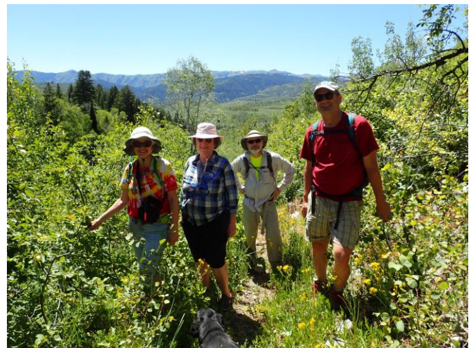
CVUU Hikers with views of the Bear River Range