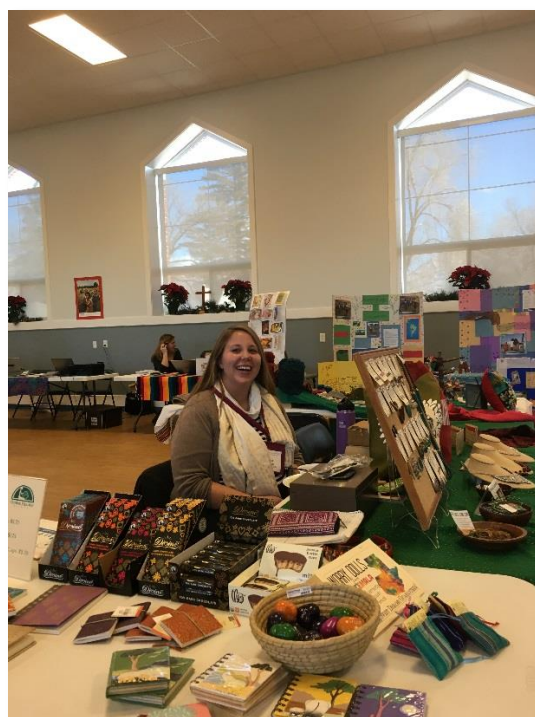
Various community groups staff tables at the 2015 Alternative Gift Market - photo credits: Jenny Norton