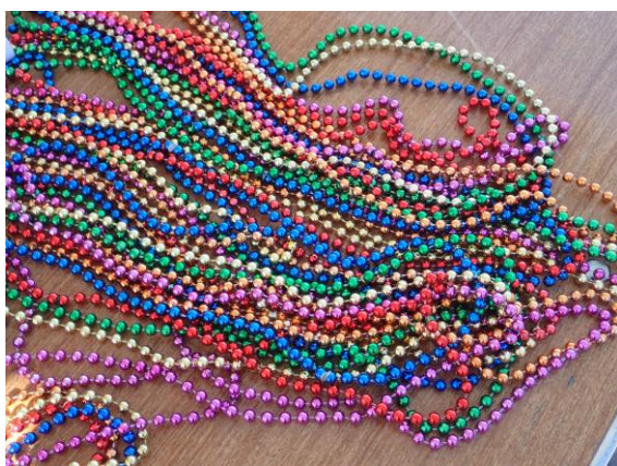
Rainbow party beads: Photo credit: Susanne Janecke