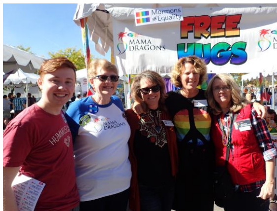
Mama Dragons Free Hugs!