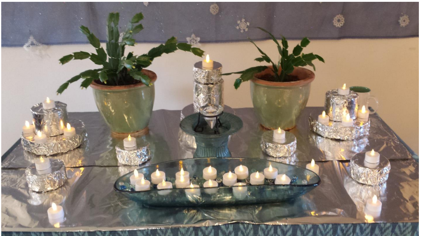
Winter Solstice 2016 Celebration altar